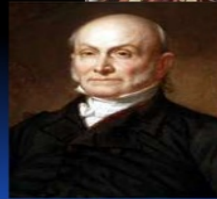
John Quincy Adams